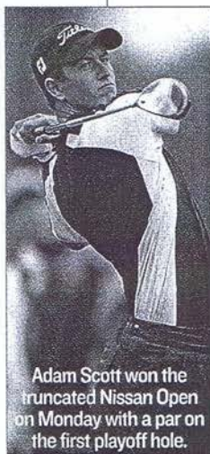
Adam Scott won the truncated Nissan Open on Monday with a par on the first playoff hole.

MR: THE FUN PART IS, I GET TO GO TO LA COSTA AND DO IT AGAIN THIS WEEK. THE WEATHER REPORT DOESN'T SOUND GOOD THERE, EITHER.